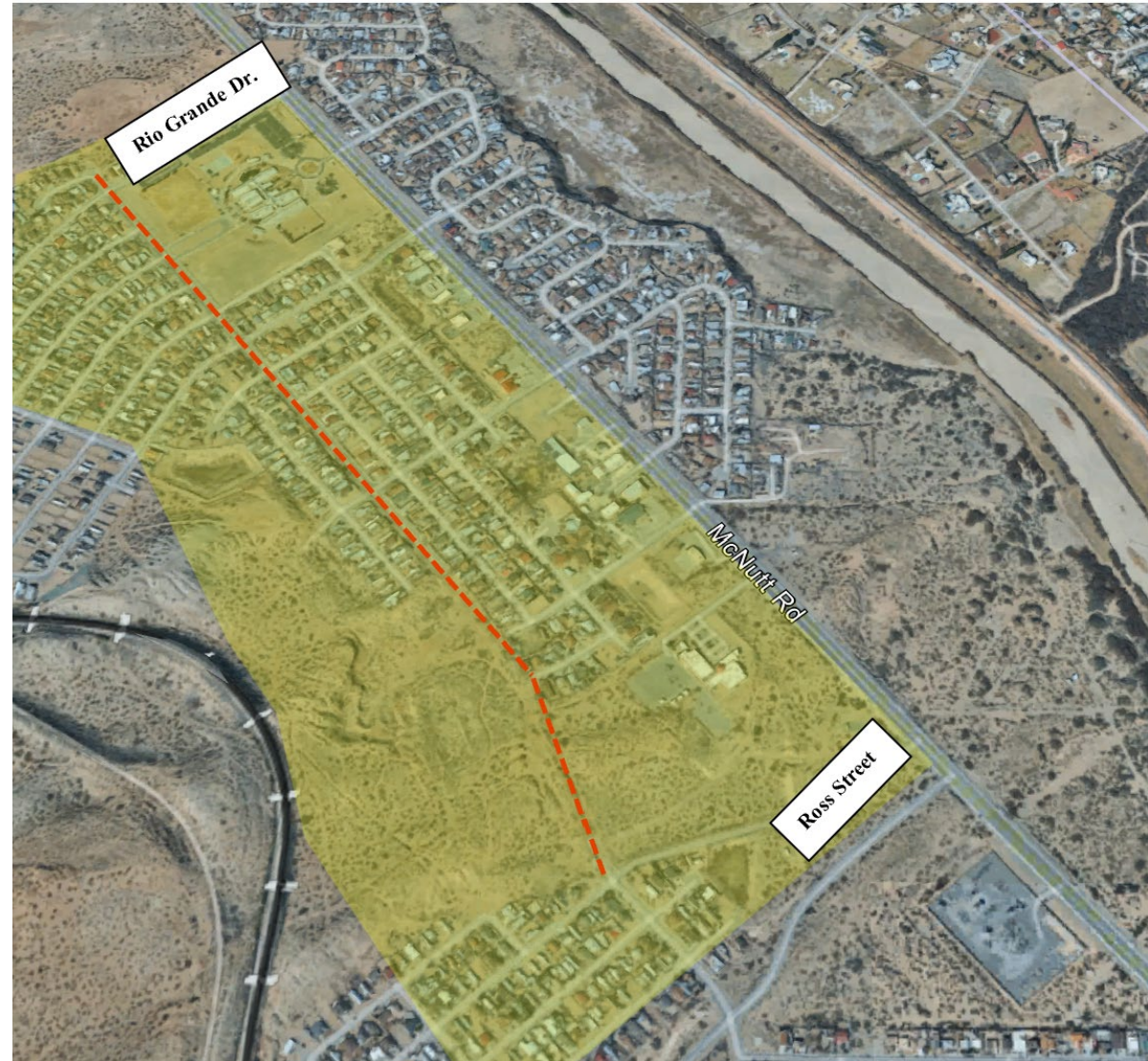
Exhibit 'A' Monte Cristo Boulevard Corridor Study Area